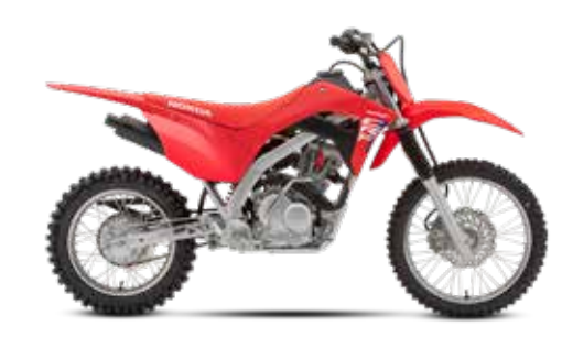
Extreme Red New *Big Wheel variant also available.