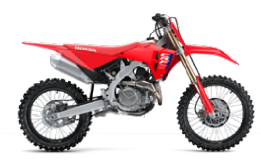
Extreme Red New