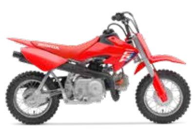
Extreme Red New