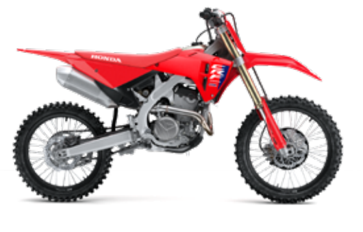
Extreme Red New