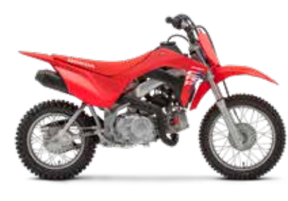
Extreme Red New