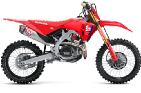
Extreme Red New