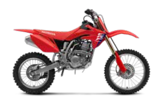
Extreme Red New