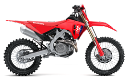
Extreme Red New